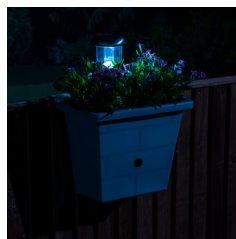
Solar powered light